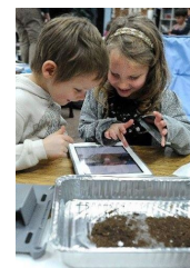
Kindergartners work with an iPad to write a book titled "Seeds to Trees."

Note: Until you turn in your New Hire Packet, you will NOT receive a contract/notice of assignment, an employee ID or gain access to District systems (including email). Therefore, please be prompt when submitting your New Hire Packet.