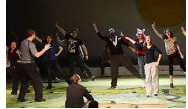
Mountain View High School’s “Shrek the Musical” production requires lots of rehearsal.

You will receive an Induction certificate in mid-April. You will submit this Certificate with your application for your Professional license.