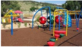
New playground equipment at Big Thompson Elementary.

“In learning you will teach, and in teaching you will learn.”